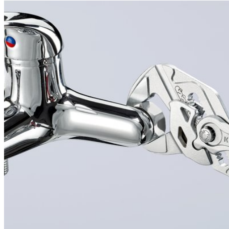
Working on plated fittings without damage of the surface